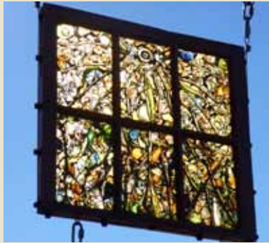
GLASS ART BY PAMELA PERKINS