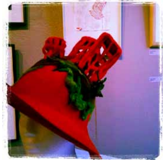
Top middle: Multiculturalism , Ellen Hardy; above: Cityscape. , Alikya Wingate