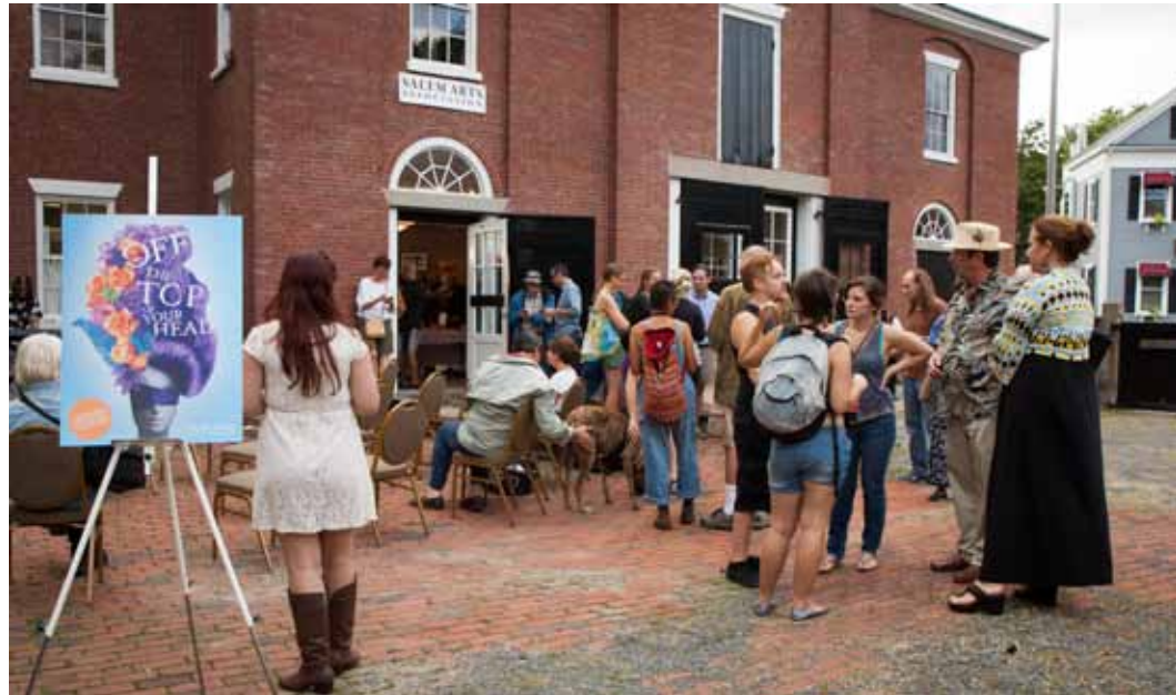
Left page, right column, top to bottom: guests enjoying the exhibition; and the opening reception in the courtyard of the Andrew-Safford house's carriage barn; to the music provided by Bad Actors